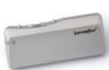
RC-P – remote control

The key to comprehensive wireless connectivity and mobile communication is SoundGate, an easy-to-use interface between Chronos hearing solutions and external audio sources, such as cellular and landline phones, computers, TV sets, and music players. Accessories for Bluetooth® wireless connectivity include: