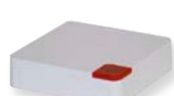
Phone adapter – wireless link to landline phones