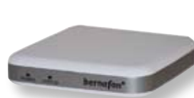
TV adapter – for wireless reception of TV signals