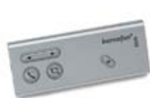
SoundGate – interface for wireless connectivity